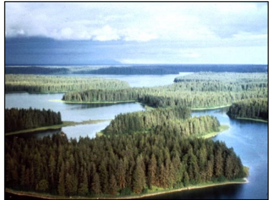
Originating as a tiny outlet stream for a northern Minnesota lake, the Mississippi River progresses into a river system that drains all or parts of 31 states before reaching the Gulf of Mexico.

All living things, including people , are inextricably linked to the watershed in which they live. Technological advances in water quality protection formed the foundation of public health, and threats to water quality continue today. Watershed protection contributes not only to safe drinking water and irrigation supplies for crops, but also flood management, recreational opportunities, wildlife habitats, and the healthy functioning of river systems. By becoming more aware of your connections to your watershed and doing your part to reduce harmful impacts, you can make a meaningful contribution to water quality protection.