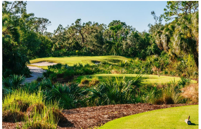
Collier's Reserve, Naples, Florida

The Signature Sanctuary Program starts where minimum environmental compliance leaves off, offering a "beyond compliance" approach, continues through construction, grand opening, and long-term management. In addition to minimum certification standards, each project is given the opportunity to work towards three (bronze/silver/gold) different levels of certification. The program is flexible and adaptable to the project, but generally involves: