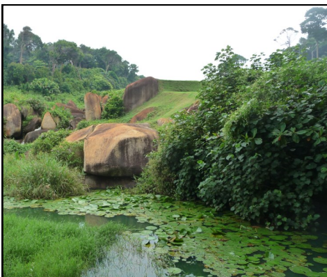
A 27-hole golf facility on 156 acres of the 475 acre rain forest resort, Ria Bintan is located in a tropical climate and receives 140 inches of rain a year. In October 2010, Ria Bintan became the first Certified Classic Sanctuary in Indonesia. Designed by Gary Player, the 18-hole Ocean Course and the first nine holes of the 18-hole Forest Course opened for play in October 1998 and December 2000 respectively.