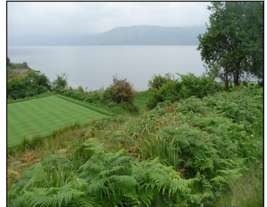
Spring City Golf and Lake Resort is a 36-hole golf facility located on the shores of Yang Zhong Hai Lake about an hour from Kunming, China. The 18-hole mountain course was designed by Jack Nicklaus and opened in 1996. The 18-hole lakeside course was designed by Robert Trent Jones II and opened in 1999. Spring City was certified as a Classic Sanctuary in 2010.

A member of the Classic Program must meet minimum program requirements applicable to all members, plus any additional site-specific requirements identified by Audubon International. In the process of seeking certification, it must host several site visits, submit monthly project progress reports, and implement a Classic Program Management Plan developed by qualified environmental consultants as well as meet standards equivalent to the Signature Program for maintenance facilities. Certification is subject to passing a final on-site audit of the property. Costs: Registration fee ($4,500), site visit travel expenses, and annual membership fee ($500). The cost of the biennial re-certification site visit is $800 plus travel expenses.