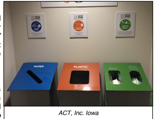
ACT, Inc. Iowa

The ACSP assists organizations and businesses in taking stock of its environmental resources and any potential liabilities, and then develops a plan that fits its unique setting, staff, budget, and time. Organizations and businesses of all sizes, budgets, locations, and characteristics are welcome to participate in this program, and may include resorts, corporate parks, community colleges, cemeteries, churches, retail stores, manufacturing facilities, and parks, among others.