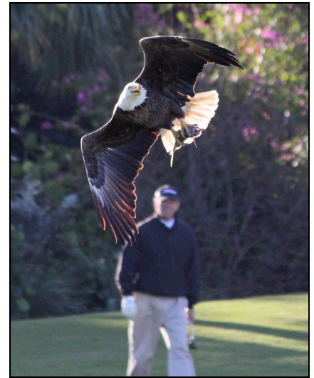
Golfers share spaces with all types of amazing creatures!

Golf's use of chemicals, water, and other resources to maintain pristine golfing conditions has long been criticized for threatening the quality of our environment. While these issues are a real concern, golf actually has a unique opportunity to protect and enhance our environment. By their very nature, golf courses provide significant natural areas that benefit people and wildlife in increasingly urbanized communities across North America and throughout the world. In recent years, through education and certification by the ACSP, golfers and non-golfers alike are taking a second look at the nature of the game. Golf courses offer numerous opportunities to not only provide pleasant places to play, but also to protect drinking water, improve the water quality of on-site and surrounding lakes, streams, and rivers, support a variety of plants and wildlife, and protect the environment for future generations.