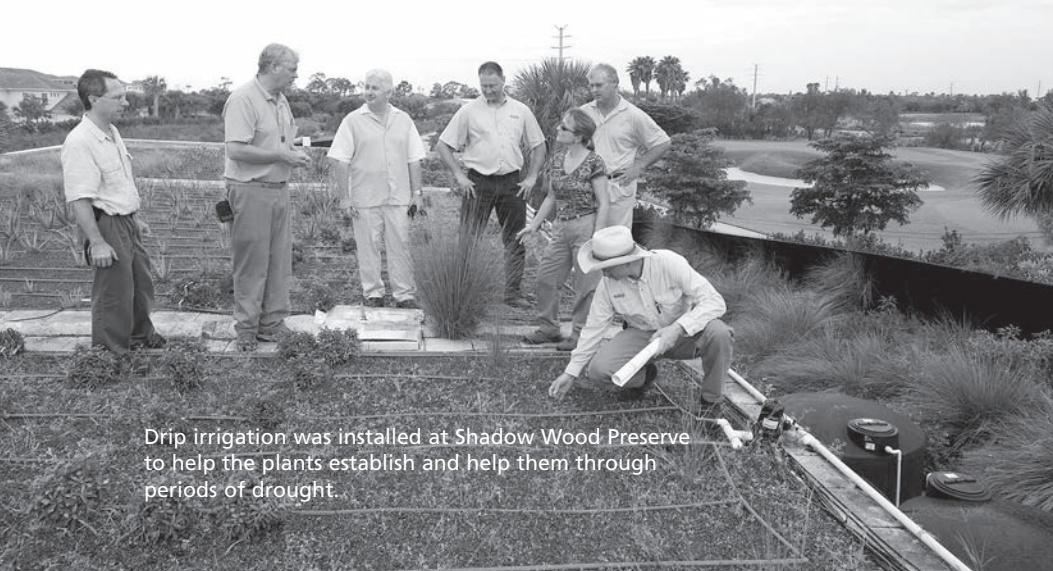
Drip irrigation was installed at Shadow Wood Preserve to help the plants establish and help them through periods of drought.