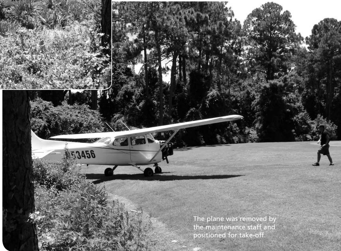
The plane was removed by the maintenance staff and positioned for take-off.

One afternoon, a winged visitor of another sort landed at Shark's Tooth Golf Club. It was just a short time after take-off before the engine of a Cessna 172 started to lose power and stalled at four thousand feet. The pilot needed to find a place to land fast! Since the beaches were full of people and the highways were full of vehicles, he began looking for open space. The closest thing he saw to an open field was a golf course fairway. The quick thinking pilot dodged large trees and sand traps, and was able to land the plane safely.