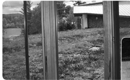
The green roof at the Golden Arrow Lakeside Resort was installed using grids. The view out this window is greatly enhanced from the old asphalt roof.