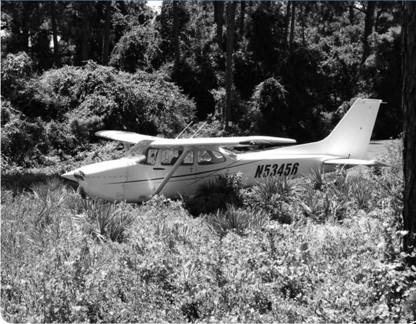
< The pilot was unable to stop the plane before the dense vegetative corridors between the tee complexes.