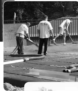
The use of grass on top of the roof necessitates the need for ongoing irrigation at Merion Golf Club. The growing medium was blown in, spread by hand, and then smoothed by machine. Note the waterproof membrane.