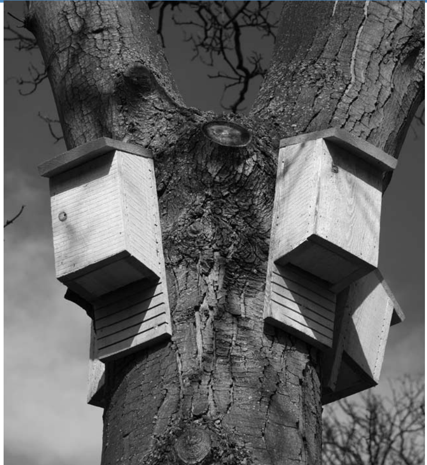
Putting up a bat house creates needed bat roosting sites for these beneficial insect-eaters and does not have to be an eyesore.

Bats are an important part of many ecosystems. Bats pollinate flowers, help to keep insect populations at manageable levels, and provide excellent opportunities for public education. Putting up a bat box offers bats a place to roost or rear their young. However, it is difficult to attract bats to an area if they are not already present in nearby woodlands, caves, or man-made structures. Bats normally return to the roost where they were born. However construction and loss of habitat may cause local bats to seek new homes. When you are outside at dusk, observe the sky for "birds" that flap their wings quickly, fly slowly and