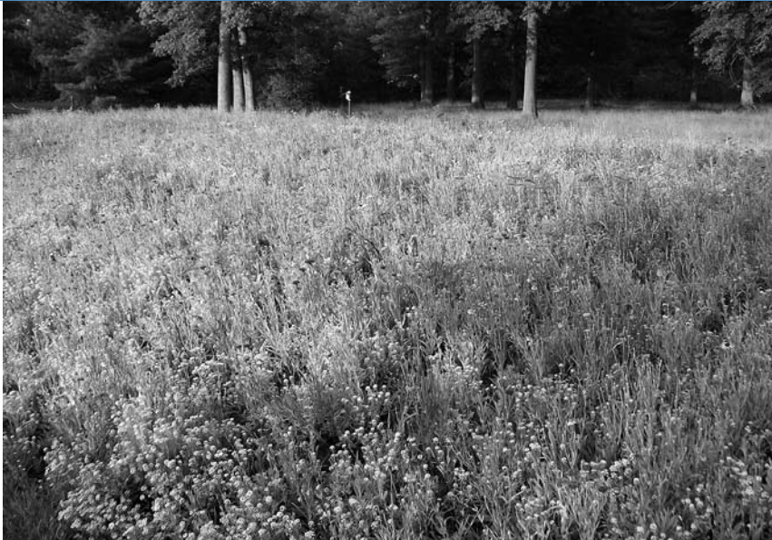
An area that has been top dressed with wildflower seed increases the visual appeal of the course while lowering upkeep costs.