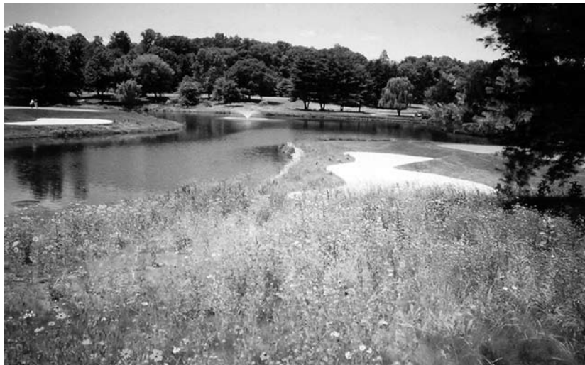
Edgewood Country Club in River Vale, New Jersey