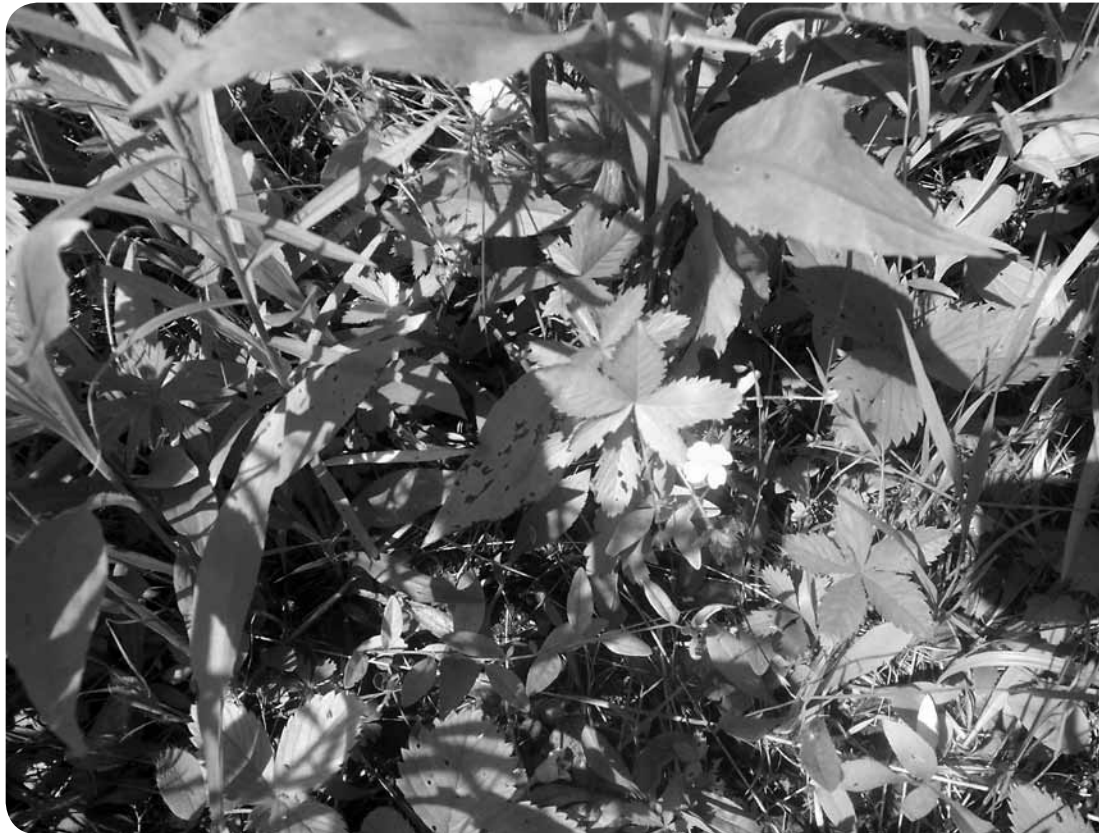
Small sundrops in bloom.

Located one hour from Chicago in the northeastern corner of Lake County, the course property totals 243 acres with only 33 percent of the course, or 80 acres, as maintained turf. The majority of the turf is pennlinks bentgrass, which was used for the greens, tees and fairways, and was chosen for its upright growth habit and less thatch characteristics. The rough is a combination of four cultivars of Kentucky bluegrass with native prairies used as a buffer between turfgrass and water to