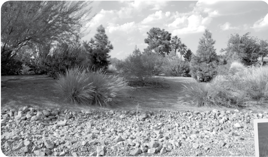
Reducing the amount of turf at Wildhorse Golf Club saves $70,000 annually.

application, host a site visit by a SNWA representative who will pre-measure the area to be converted and take pictures, and sign a covenant agreement stating that the land will never be converted back to turfgrass. Like a conservation easement, this covenant transfers along with the land from owner to owner.