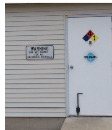
Pesticide Storage Shed - Elm Crest Country Club