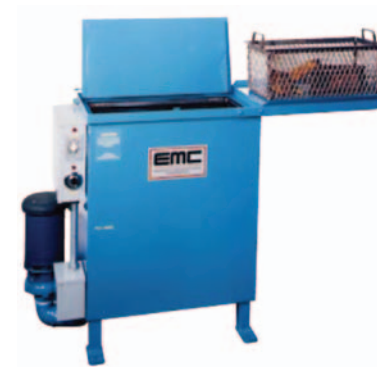
An alternative to water-based washing is this Jet-Spray washer unit