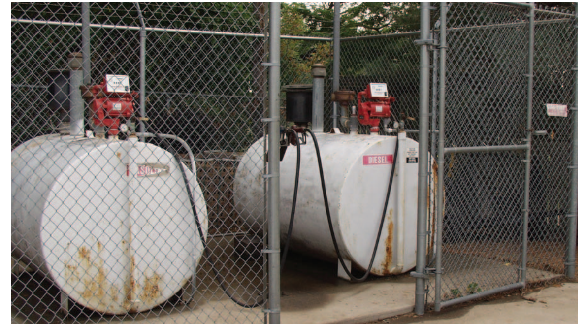
Fuel Storage Tanks - Elm Crest Country Club

Golf courses typically have aboveground and/or underground fuel storage tanks on site. Title 40, Section 112 of the Code of Federal Regulations (CFR) requires a Spill Prevention Control and Countermeasure (SPCC) plan for facilities with total aboveground petroleum product storage (i.e., new oil, used oil and fuel) capacity in excess of 1,320 gallons. SPCC plans are designed to minimize the potential for a petroleum release to occur and mitigate any environmental impacts in the event one does occur. The SPCC regulations generally require secondary containment for filling and dispensing operations. However, alternatives (i.e., contingency plans) are allowed if such containment is impractical. Contact the IWRC for assistance in obtaining an SPCC at 1-319-273-8905.