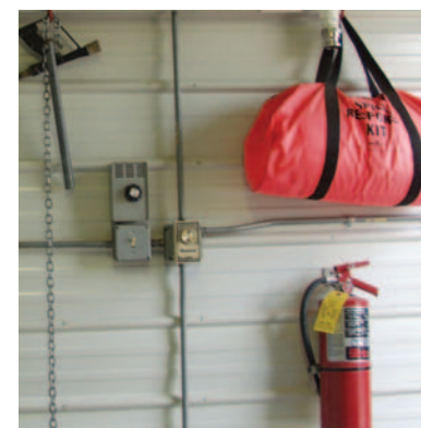
Pesticide storage spill kit - Elm Crest Country Club

During the mixing and loading of pesticides, small spills may occur. Should an accidental spill occur, the spill(s) should be cleaned up as soon as possible. The sooner a spill is contained, the less chance there will be for harm to the environment. Always use the appropriate personal protective equipment as indicated by the MSDS or label direction for the chemical being cleaned up. Follow these steps to clean up small spills safely: