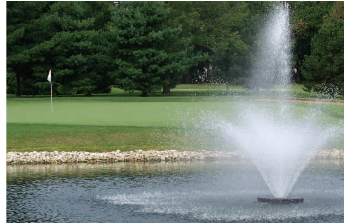
Elm Crest Country Club