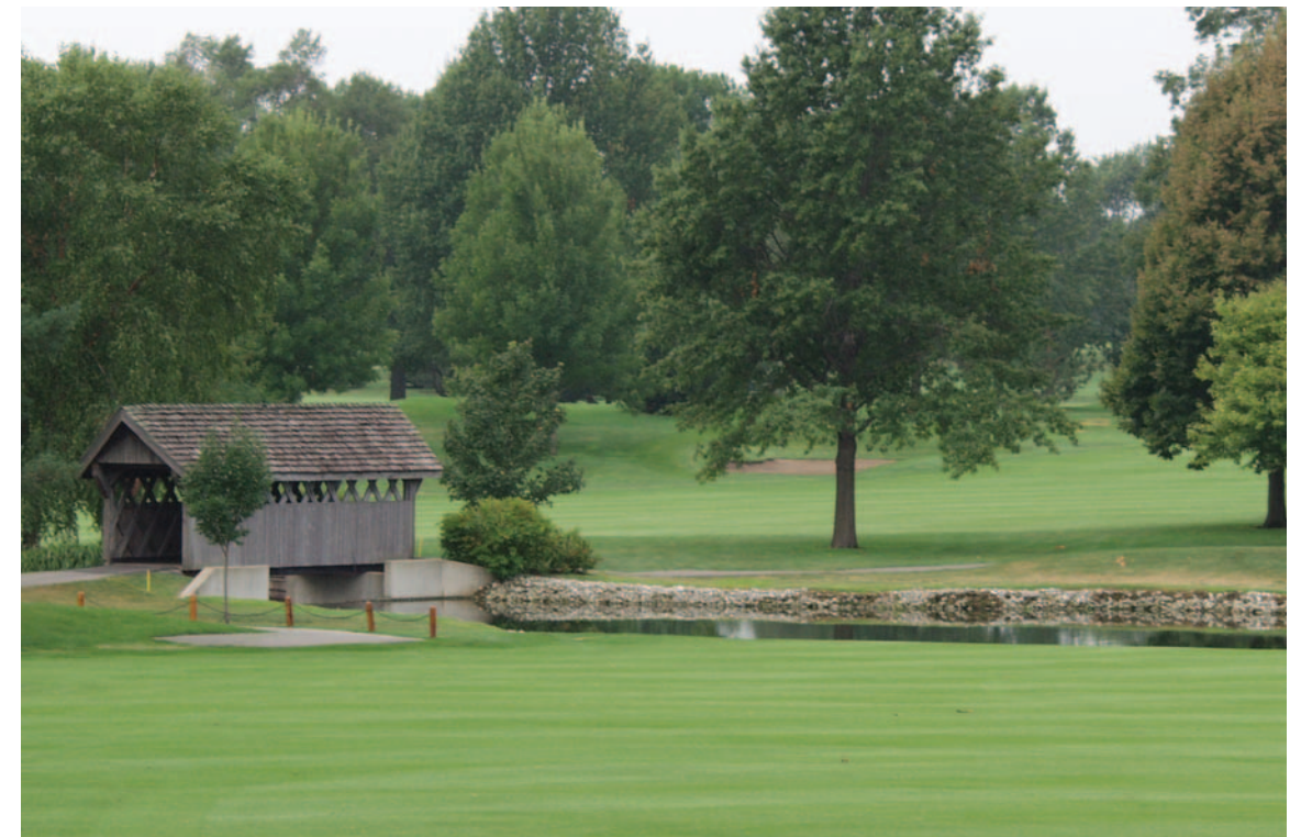
Elm Crest Country Club