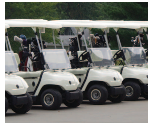
Golf Carts- Elm Crest Country Club

Management of rinseate from washing pesticide containers is discussed in detail in the Pesticide Disposal Section 11.5.