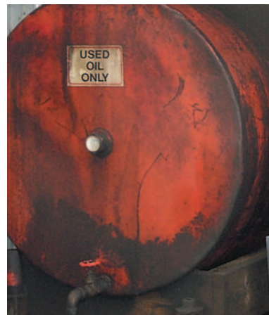
A used oil storage container

Once the bulk of the spill is cleaned, a soap and water solution may be used to clean the residual oil sheen. This wastewater can be discharged to the local wastewater treatment plant. Do not discharge this water directly outdoors or to a septic system since even non-toxic soaps can pollute soil and streams and inhibit the functioning of a septic system.