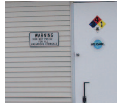
A storage shed - Elm Crest Country Club