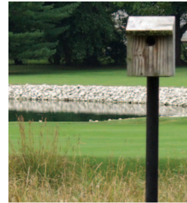
Bird House - Elm Crest Country Club