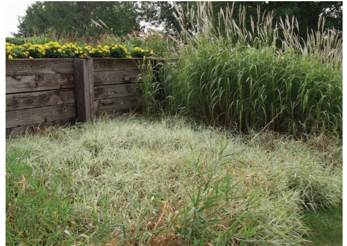
Elm Crest Country Club